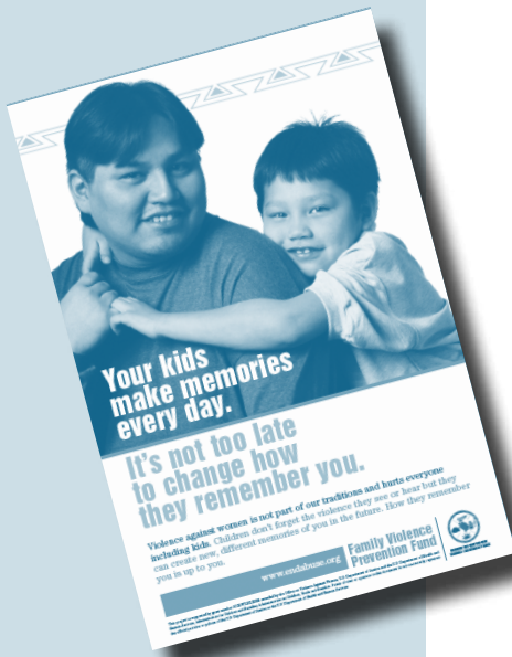
FAV Poster, created in collaboration with Mending the Sacred Hoop

A simple change that all centers can accomplish is to provide literature and posters that address men specifically. If reading materials are available, some should reflect the fathers' interests, such as sports and home improvement magazines. There could also be newsletters, brochures, books, and local resource information that address issues of positive fathering, violence prevention, and masculinity. 29 It goes without saying that publications that glorify negative stereotypes of masculinity should be avoided.