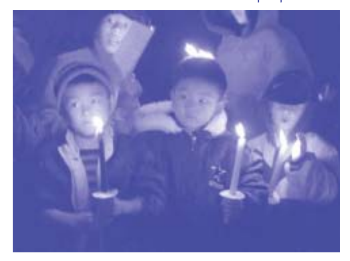
Children at an Initiative for Violence Free-Families vigil.

Leadership development is a core premise of any good community engagement effort and a critical task of all of the groups surveyed by the FVPF. Finding and fostering new leaders creates messengers who can help raise awareness about family violence and articulate the connections between child abuse and domestic violence. Leaders mobilize people to action, engaging them in new activities to identify and