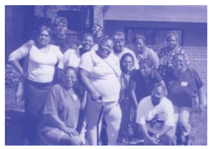
Queen Lane Domestic Violence Community Mobilization Initiative peer leaders.

All across Massachusetts, Community Connections coalitions bring community members and parents together with representatives of child welfare agencies, domestic violence programs, and other service providers to build neighborhood-based networks that reduce child abuse, support healthy, nurturing