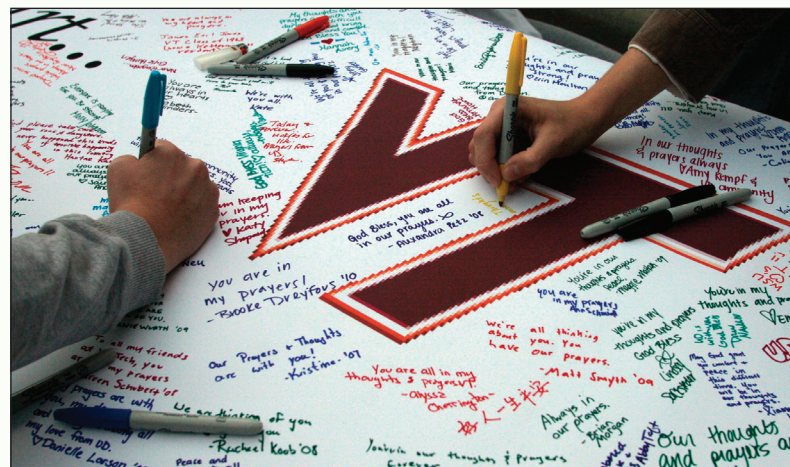
Students from the University of Dayton in Ohio sign a banner to be sent to Virginia Tech after the massacre that left 33 people dead, including the killer.