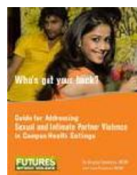
Campus Handbook The handbook provides strategies, tools and resources for providers, staff and students working in campus based health settings to incorporate intimate partner and sexual violence prevention and response into their work.

and discuss campus sexual assault. To view the documentary: www.thehuntinggroundfilm.com