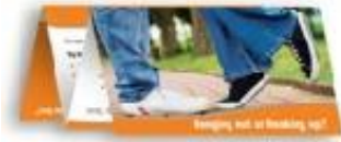
Hanging Out or Hooking Up Available In Spanish The safety card was

designed in partnership with the Children’s Hospital of Pittsburgh. It challenges teens to consider how their partner treats them and identifies signs of a relationship that may indicate abuse, as well as the dynamics of consensual sex versus pressured sex.