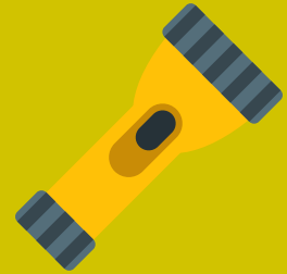
Based on Need